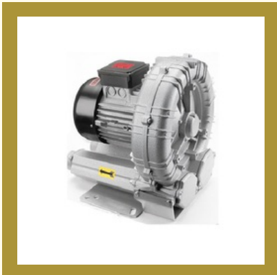
Textile Industry Turbine Blower