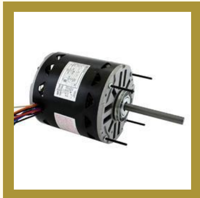
Dual Speed Motors