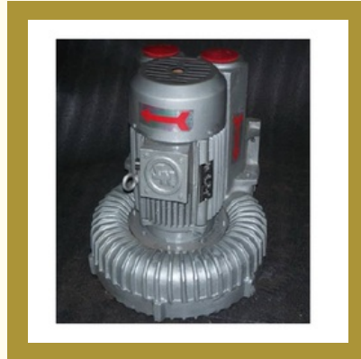
High Vacuum Blower