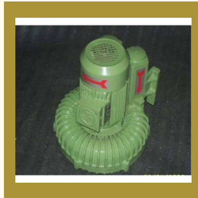
Industrial High Pressure Blower