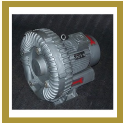
2000 Rpm High Pressure Blower