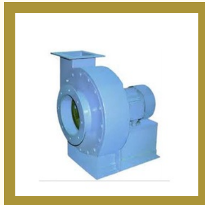
Multi Stage Fabrication High Pressure Blower