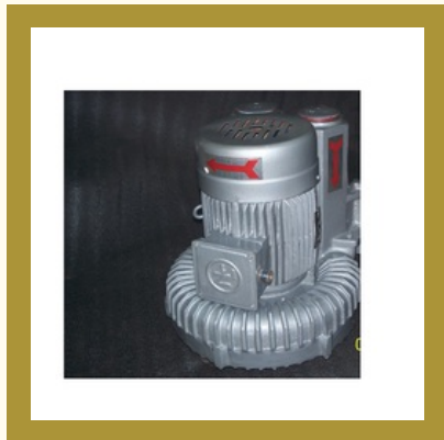
High Pressure Blower