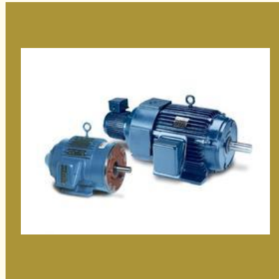
370 W Torque Motors