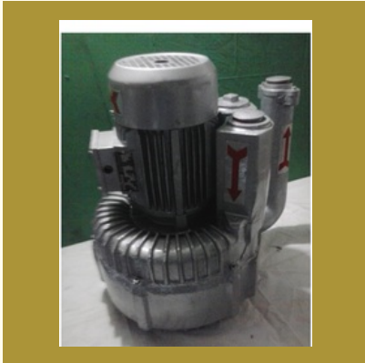
Double Stage Turbine Blower