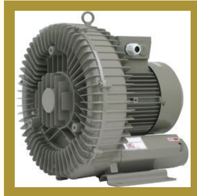
Agriculture Turbine Blower