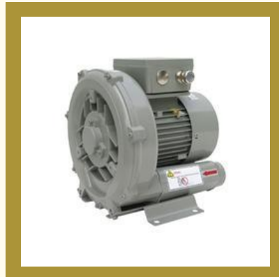
0.25 HP Quarter Size Vacuum Blower