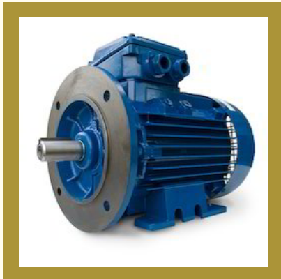
Flange Mounted Motor