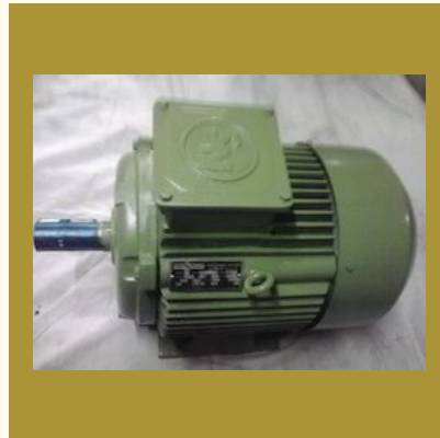
Foot Mounted Motor