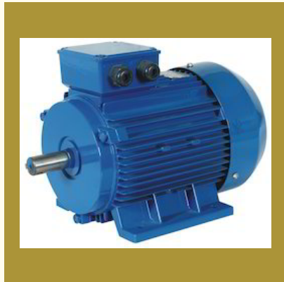
Industrial Electric Motors