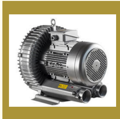
Single Stage Turbine Blower