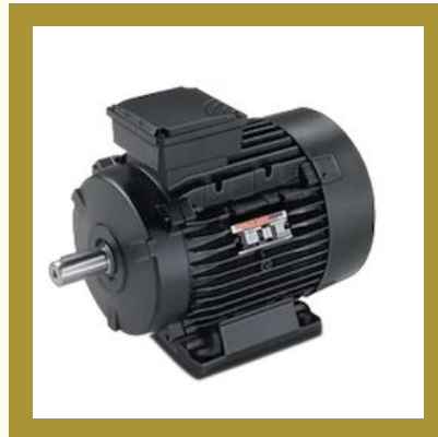
Crane Duty Motors